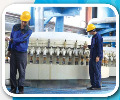
■ D-star filter machine Made by machine building unit