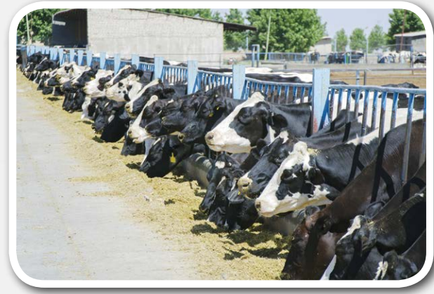
■ animal husbandry