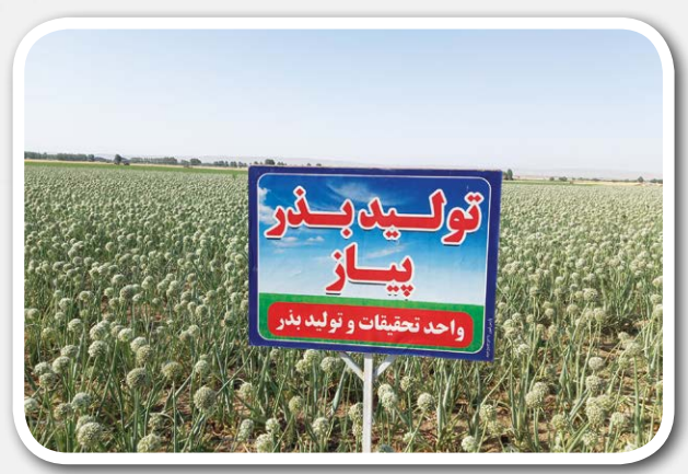
onion seed cultivation fields