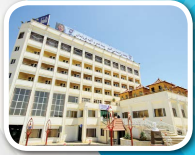
■ Kamelia Hotel